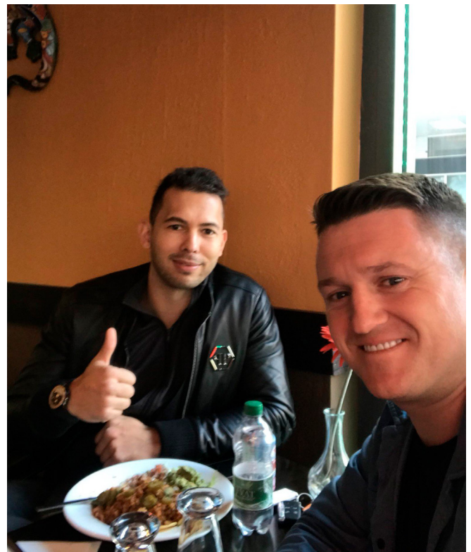
Andrew Tate with Stephen Lennon (aka Tommy Robinson)