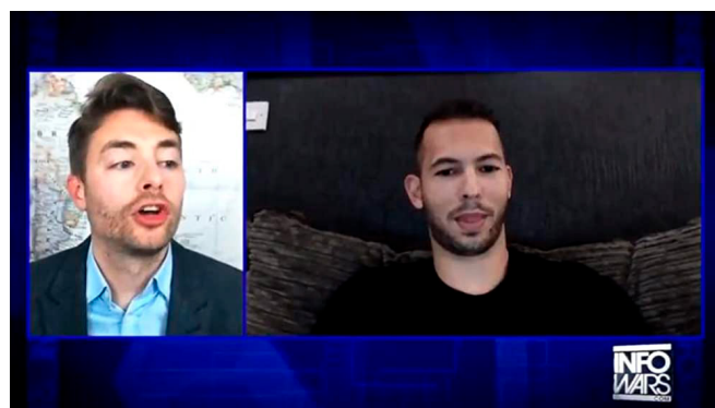
Andrew Tate on InfoWars with Paul Joseph Watson

Tate claims to have 1000 people working for him doing this and that is why he has “conquered the platform”. He tells his supporters that they can earn significant sums by sharing his videos; in one podcast he claimed that a 16-year-old Hustler University student is making £45,000 a month from publishing clips of Tate on Tik Tok.