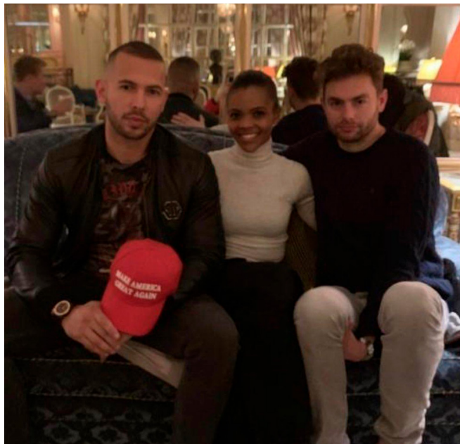
Andrew Tate, Candace Owens, Paul Joseph Watson

Mike Cernovich visited the Tate brothers in Romania in 2019, describing them as his “friends” in the description of his podcast. 19