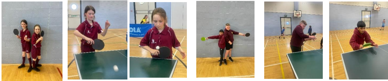
TABLE TENNIS COMPETITIONS AT ALL SAINTS HIGH SCHOOL